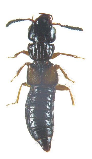
Fig. 1. Oxytelus almorensis CAMERON from Taiwan.